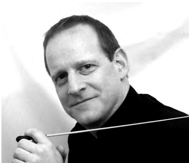
Lowell Liebermann celebrates flutists' collective zeal for new works.