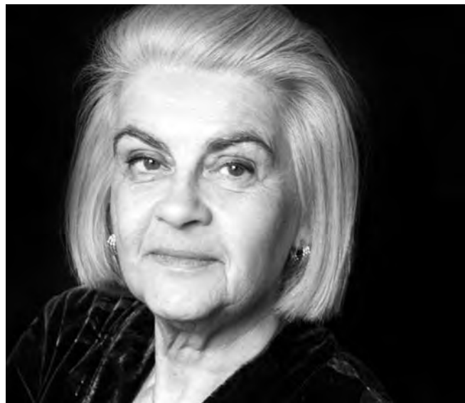
Katherine Hoover plays flute in addition to composing for it.

An outstanding flutist, Hoover has performed and recorded a number of her own compositions. Her flute works are significant