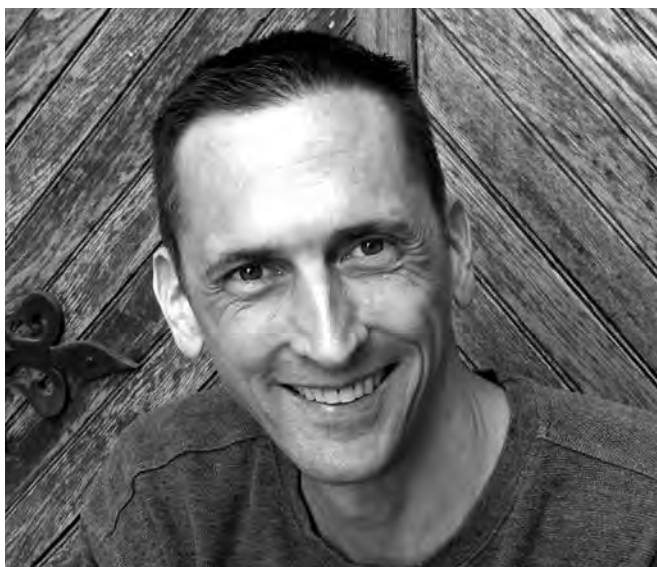
Martin Amlin. His Piccolo Sonata premiered in 1997 at the NFA convention.

Noted for complexity of rhythm (often with a perpetual motion and a "jazz" feel), a predilection for successive major and minor seventh chords, and a commitment to traditional compositional forms, Amlin's music is quite challenging yet lyrical and harmonically rich. Featuring the full range of the instrument, his compositions often present symmetry of rhythm, line, pitch, and form. Additionally, his compositional language has been described as still retaining its French accent, creating colors and textures invoking movement and gesture that shape lines forward.